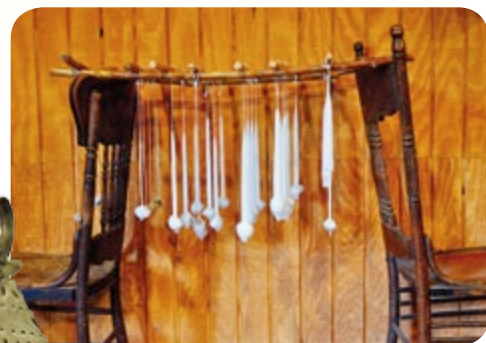
Candles were made by tying string around a rock and then dipping it in animal fat over and over.