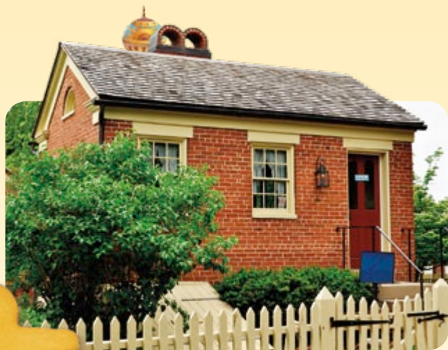
Many old buildings in Nauvoo have been restored. Missionaries dressed in 1840s clothing tell visitors about the early Saints. You can try a gingerbread cookie at the Scovil Bakery or see how shoes are made at the boot shop.

Paper and postage were expensive, so people used "cross writing" in their letters. They would write one direction, then turn the paper and write across it. Try it and see if you can read your writing!