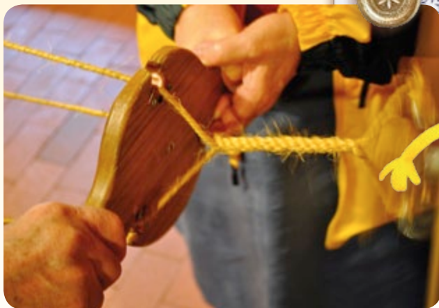
It took three people to make rope the way the pioneers did it!