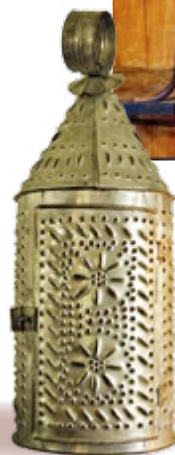
The light from this lantern made fun patterns on the walls and ceilings.