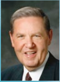
By Elder Jeffrey R. Holland Of the Quorum of the Twelve Apostles The members of the Quorum of the Twelve Apostles are special witnesses of Jesus Christ.