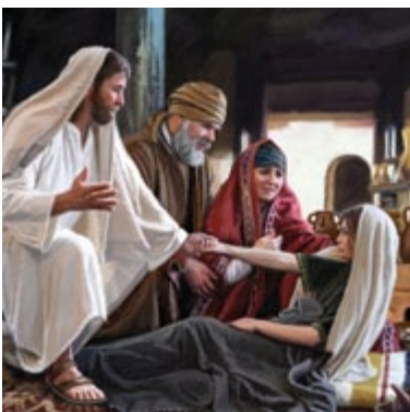
Jesus Christ taught in the synagogue and at the well. He blessed little children and raised the daughter of Jairus from the dead.

good, . . . for God was with him” (Acts 10:38).