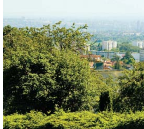
A view from Friedrichsdorf, Germany, near Frankfurt.