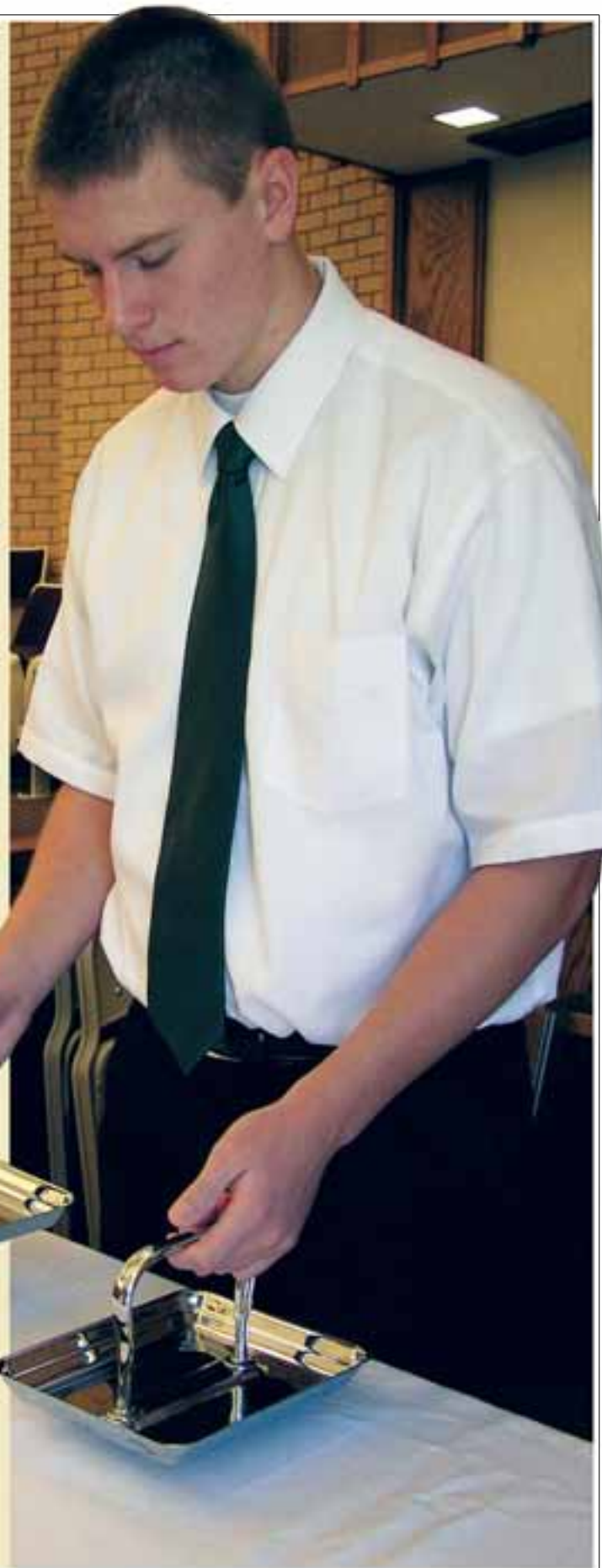
PHOTOGRAPHS BY RYAN CARR AND COURTESY OF THE HALGREN FAMILY, EXCEPT AS NOTED; LEFT: PHOTOGRAPH OF SACRAMENT BY MATTHEW REIER

Brek’s older brothers were good examples to him too. “As they prepared the sacrament, I always looked up to them,” Brek says.