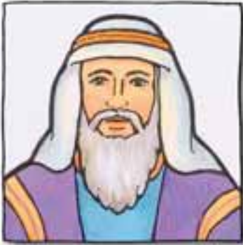
1. Captain Moroni