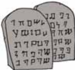
D. Ten Commandments (Exodus 20)