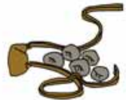
E. Sling (1 Samuel 17)