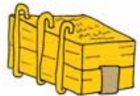
B. Gold plates (Joseph Smith-History 1:51-54, 59)

Can you match each scripture hero with the right object? Look up the scriptures if you need help.