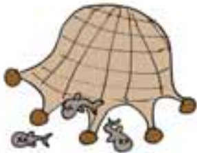
C. Fishing net (Matthew 4:18-19)