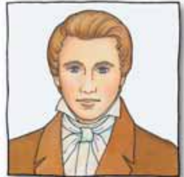
3. Joseph Smith