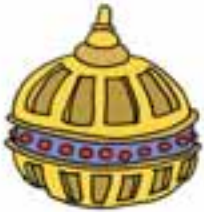
A. Liahona (1 Nephi 16:10; Alma 37:38)