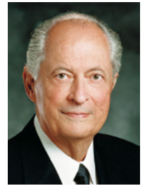
By Elder Robert D. Hales Of the Quorum of the Twelve Apostles