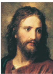
DETAIL FROM CHRIST AND THE RICH YOUNG RULER, BY HENRICH HOFMANN