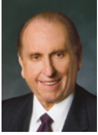
By President Thomas S. Monson