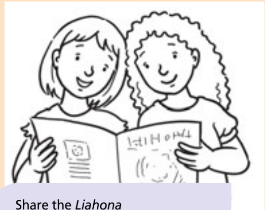
Share the Liahona