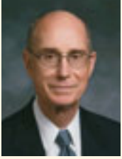
By President Henry B. Eyring First Counselor in the First Presidency