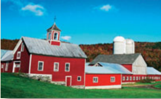
A safe place to sleep

Color the pictures of things children can do to help the Savior's lambs. Then draw one picture of something you can do.