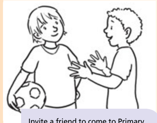
Invite a friend to come to Primary