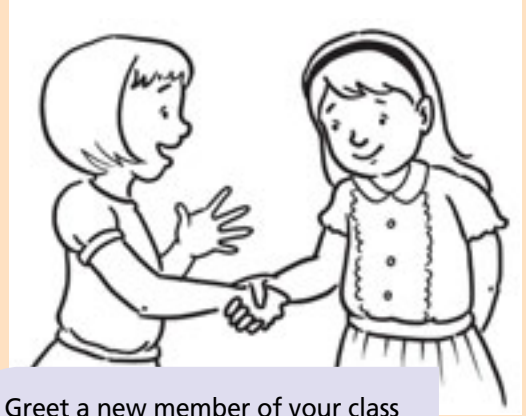
Greet a new member of your class