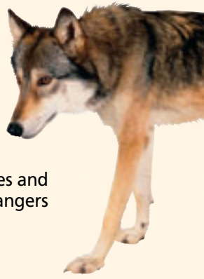
Protection from wolves and other dangers