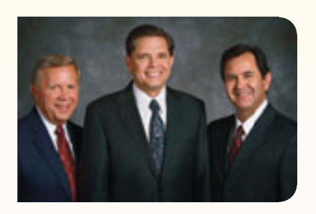
By the Young Men General Presidency