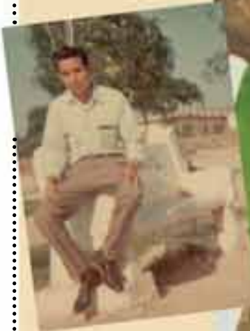
At about age 16, not long after his baptism.