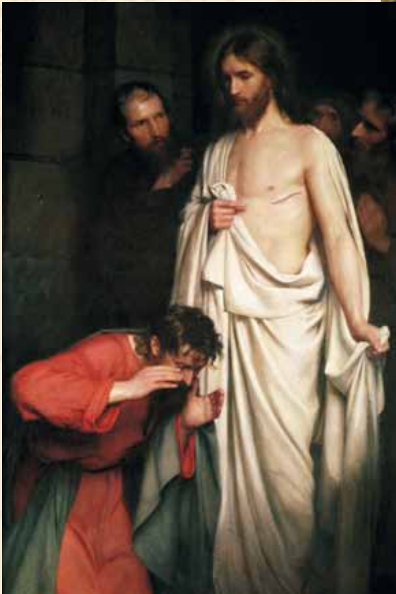
Above: The Doubtful Thomas, by Carl Heinrich Bloch

Christ said to Thomas, "Reach hither thy finger, and behold my hands; . . . and be not faithless, but believing" (John 20:27).