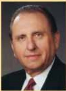
President Monson teaches us about the bridges we need to cross.