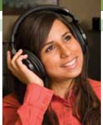
30 Worthy Music, Worthy Thoughts