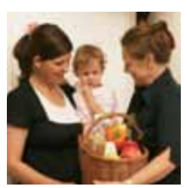
2 Treasure of Eternal Value