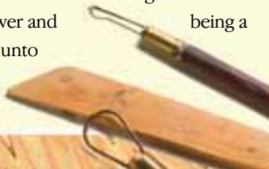
PHOTOGRAPHS BY CRAIG DIMOND, EXCEPT AS NOTED; INSET, PHOTOGRAPH BY WELDEN C. ANDERSEN, POSED BY MODELS; BORDER © ARTBEATS