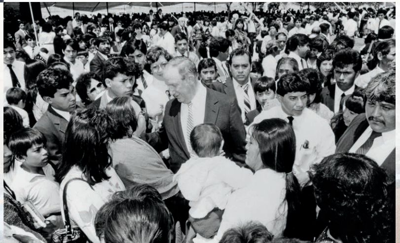
BOTTOM: PHOTOGRAPH COURTESY OF DESBRET NEWS ARCHIVE