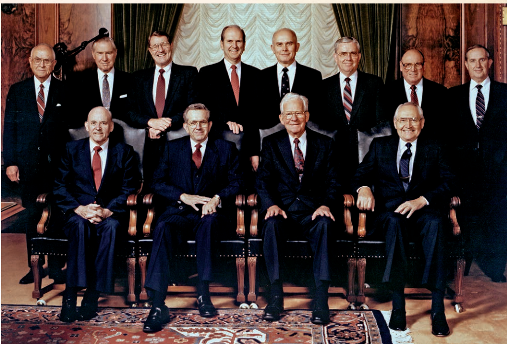
Left: Elder Scott (far right) was called to the Quorum of the Twelve Apostles in 1988, where he served for 27 years. Below left: He greets President Thomas S. Monson. Below: Elder Scott was called to serve in the Presidency of the Seventy in 1983. Bottom: Leaving general conference with Elders Jeffrey R. Holland and M. Russell Ballard.