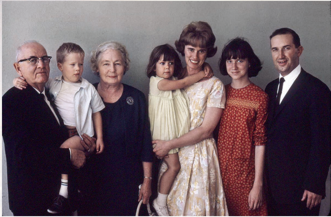
Above: President Spencer W. Kimball and Sister Camilla Kimball visited the Argentina North Mission, where Elder Scott served as mission president. Elder Scott also opened missionary work among the Quechua Indians in southern Bolivia. Below: Elder Scott, who spoke fluent Spanish, presided at the creation of the 100th stake in Mexico.