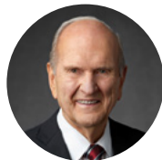
President Russell M. Nelson