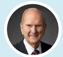
President Russell M. Nelson