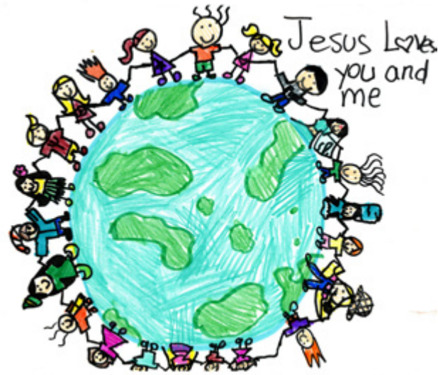
Abigail W., age 8, Arizona, USA