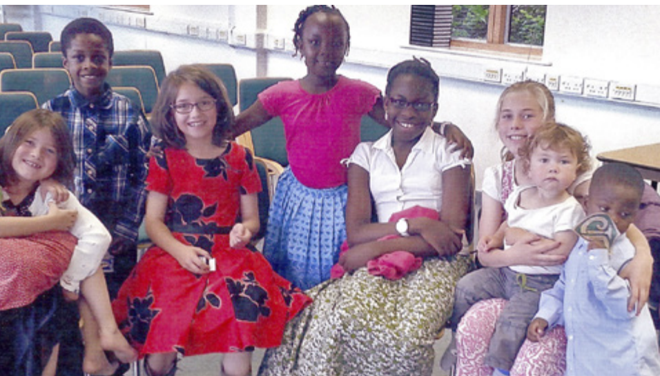
Primary children from the Aberystwyth Branch, Merthyr Tydfil Wales Stake , enjoy meeting together on Sundays and for Primary activities.