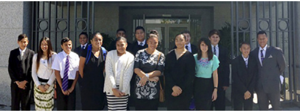
The members of the Valiant 11 Primary class, Bellbird Park Ward Primary, Centenary Australia Stake , want to serve Heavenly Father and be friends with each other. They went to the Brisbane Australia Temple together.