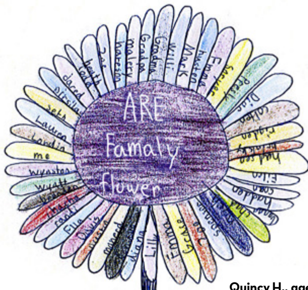
Quincy H., age 7, Arizona, USA