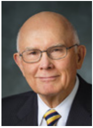
From Elder Dallin H. Oaks Of the Quorum of the Twelve Apostles