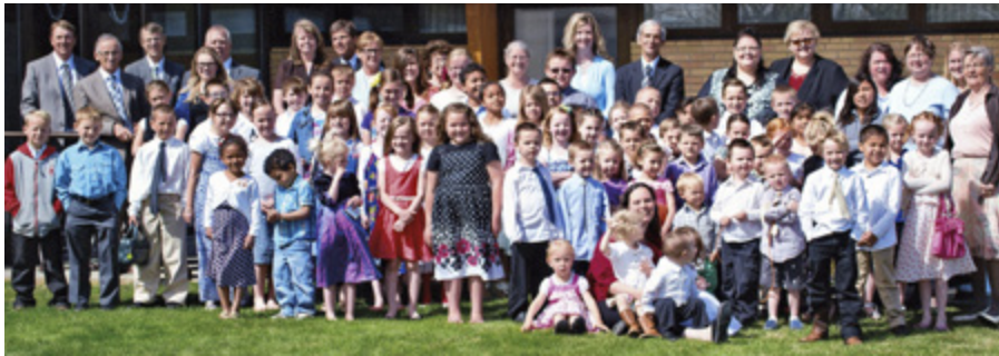
The Leavitt Ward Primary from the Cardston Alberta West Stake, Canada , recently celebrated the 50th anniversary of their chapel. The children are also learning about their ancestors. Some of their ancestors were the founders of Leavitt, Alberta, and others are modern-day pioneers.