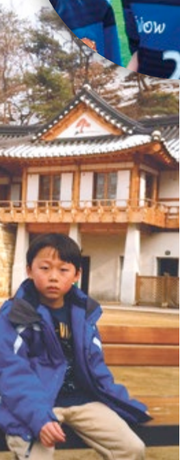
Chuseok is one of our biggest holidays. It is a celebration of the harvest—a Korean Thanksgiving.

Luca's bag is packed with some of his favorite things. Which of these things would you pack in your bag?