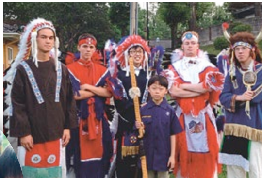
I am a citizen of both the United States and South Korea, so I take part in the Boy Scouts of America program at church.