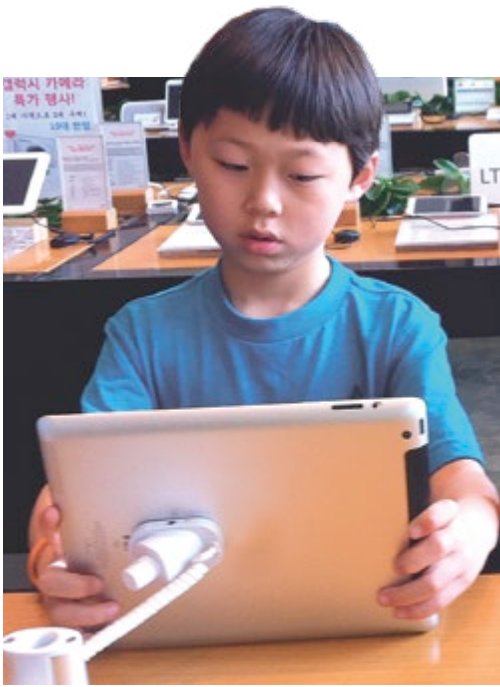
I like to read. I am bilingual, which means I can read, write, and speak in both Korean and English.