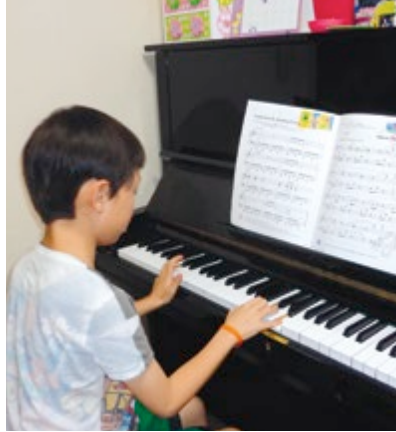
I go to school from 8:30 a.m. until 2:30 p.m. Then I go to an after-school academy called a hak-won for extra studies. I also take piano and art lessons.