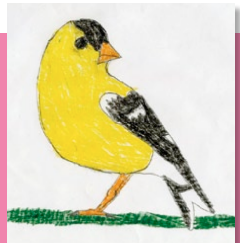
Carter M., age 10, Iowa, USA