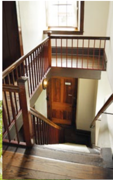
The mob ran up this stairway in Carthage Jail to get to Joseph and his companions.