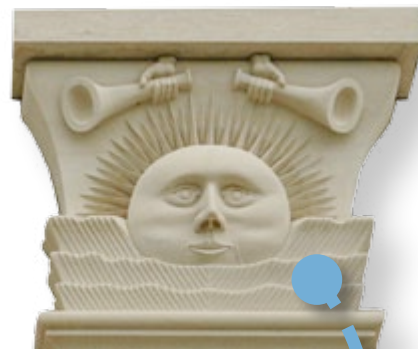
The original Nauvoo Temple had 30 sunstones.