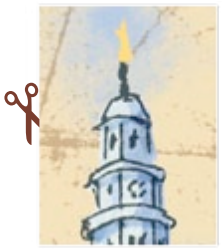
Cut out and paste to the "On the Trail" map in the July issue.

Statues of Joseph and Hyrum stand in front of Carthage Jail. "In life they were not divided, and in death they were not separated!" (D&C 135:3).