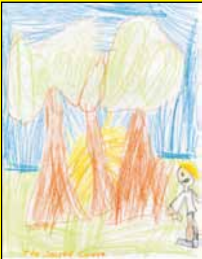
Mykelti H., age 7, Wyoming