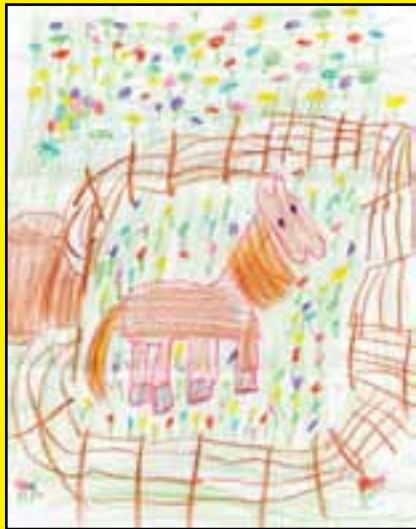
Sage A., age 7, Utah