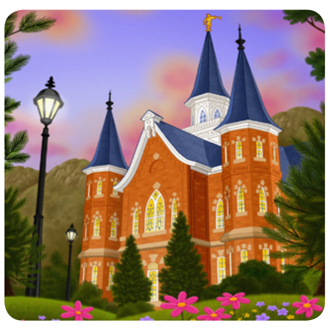
Print cards at CTR2017.lds.org.