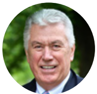
By President Dieter F. Uchtdorf Second Counselor in the First Presidency

There is an old story of a waiter who asked a customer if he had enjoyed the meal. The man said that everything was fine, but it would have been better if they had given him more than two slices of bread.