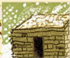
Cut out and paste to the "On the Trail" map in the July issue.