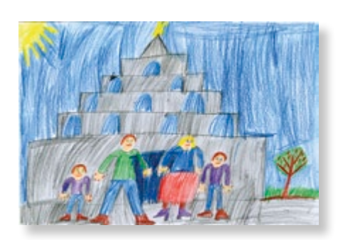
Pasha Z., age 9, Ukraine