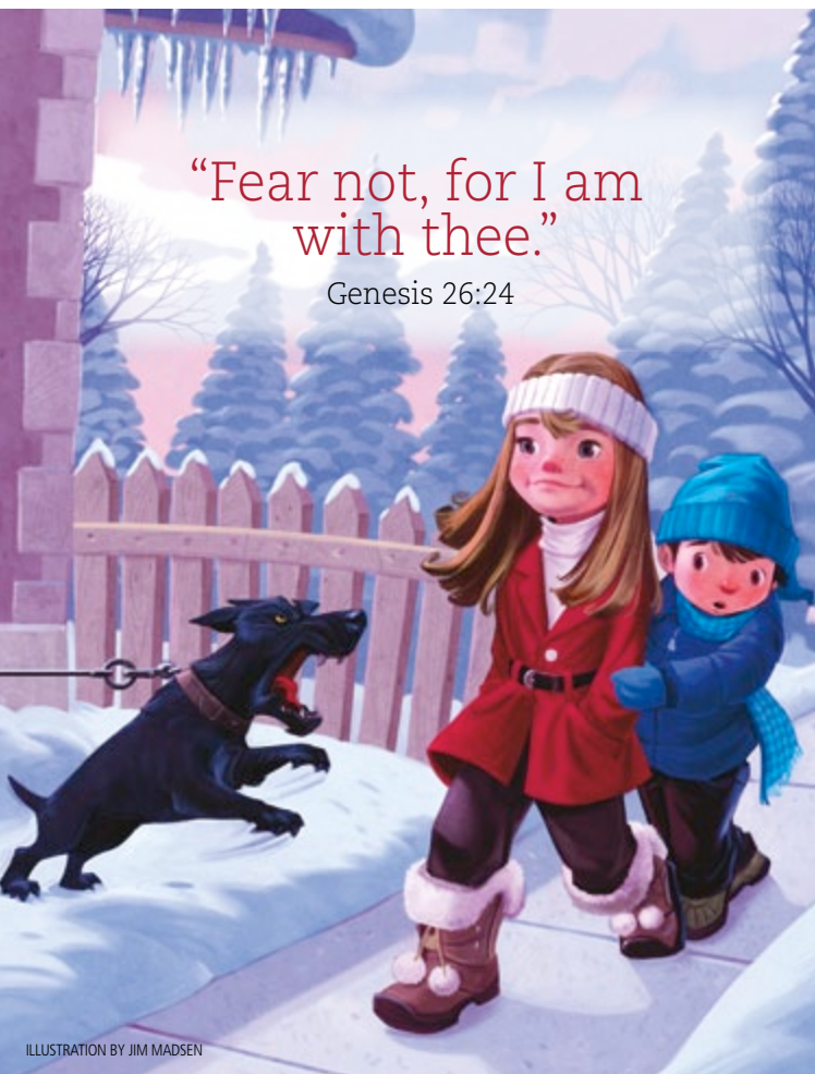
ILLUSTRATION BY JIM MADSEN