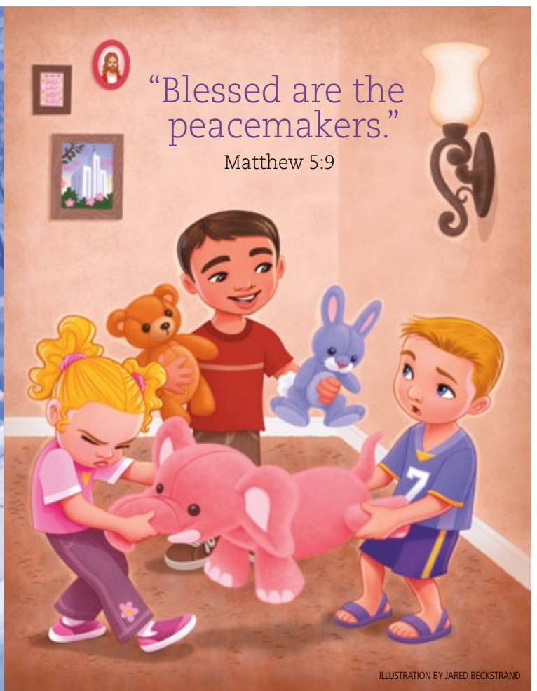
ILLUSTRATION BY JARED BECKSTRAND

“Be ye kind one to another, tenderhearted, forgiving one another.”