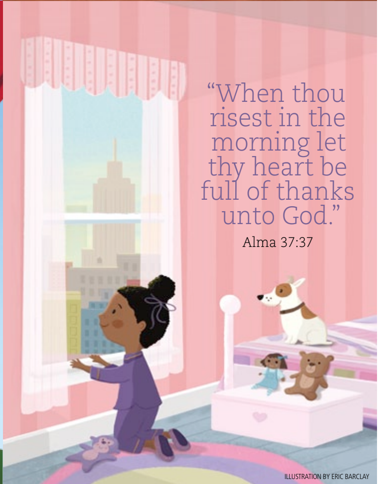
ILLUSTRATION BY ERIC BARCLAY