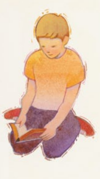
ILLUSTRATION BY DILLEEN MARSH