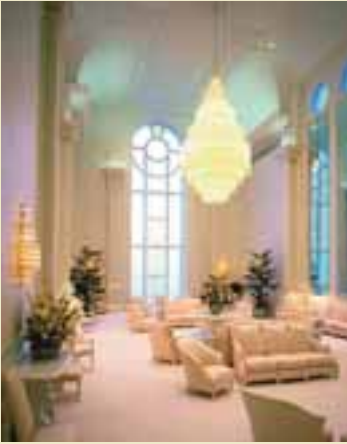
Celestial room in the Mount Timpanogos Utah Temple

After you receive your endowment, you go into the celestial room. The beauty and reverence help you feel close to Heavenly Father.