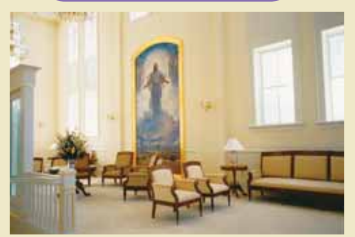
Celestial room in the Vernal Utah Temple