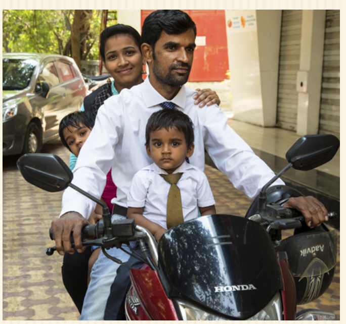
The Nalla family, Maharashtra, India, rides a motor scooter to church to watch general conference.