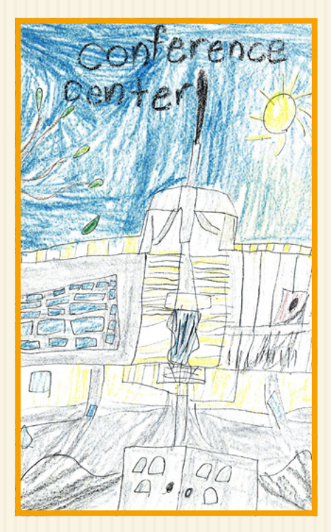
Simon P., age 7, Colorado, USA