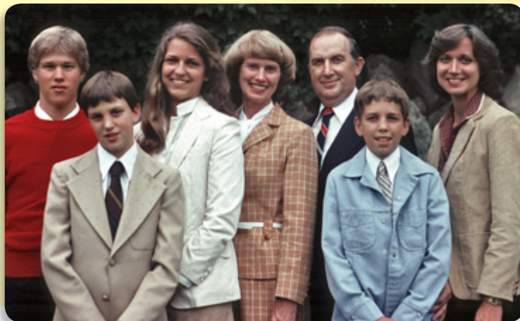
The Scott family with five of their seven children.

We can follow Elder Scott's example by always doing what Heavenly Father wants us to do. ♦