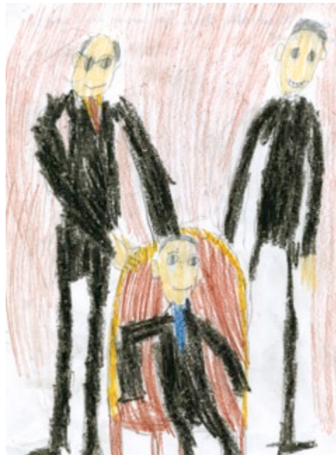
Parker H., age 6, Arizona, USA