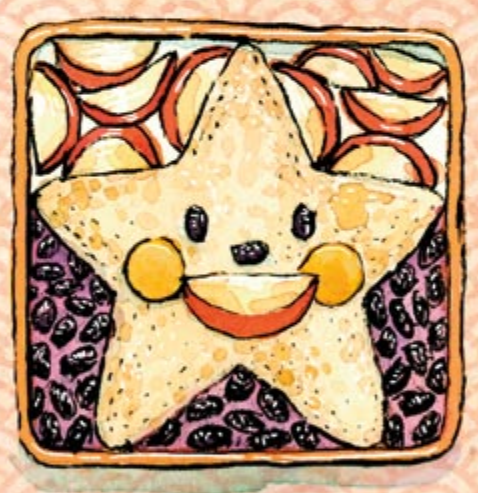
Star bento is made from a peanut butter and jelly sandwich cut into a star shape, raisins (for the eyes, nose, and background), cheese slices (for the cheeks), and apple slices (for the mouth and background).