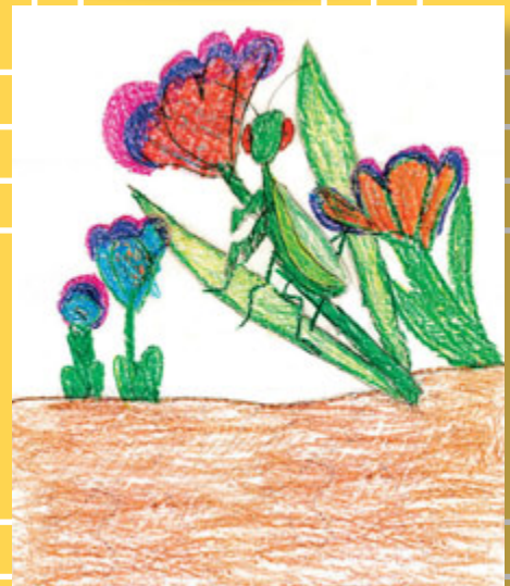
Abigail E., age 8, Vermont