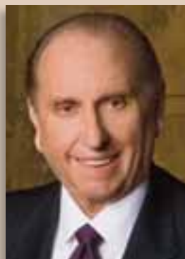
President Monson teaches us about the bridges we need to cross.

As I read of their experiences, I mused, “If only there were modern bridges to span