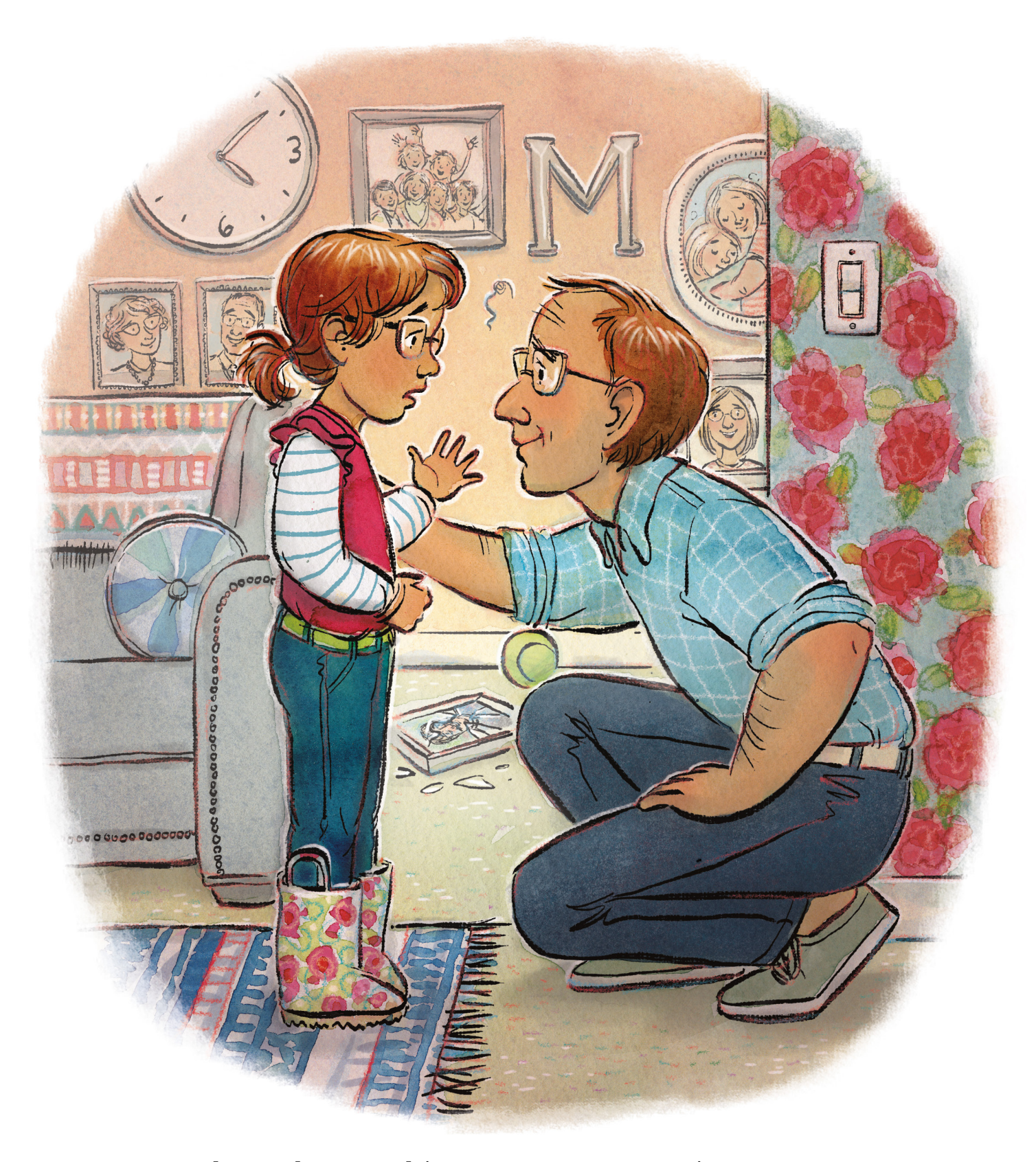
When I do something wrong, I can say I'm sorry and pray to Heavenly Father. Heavenly Father is happy when I repent, and so am I!