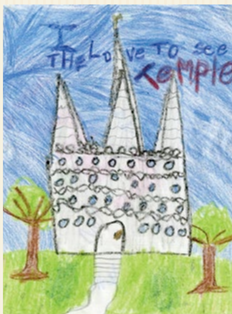
Emeline D., age 8, England