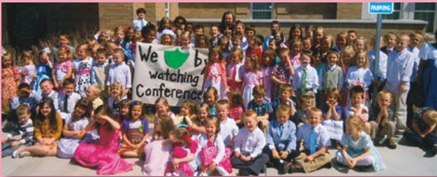
After reading the articles and activities about general conference in the March 2012 issue of the Friend , the Foxboro Fourth Ward Primary, North Salt Lake Utah Legacy Stake , decided they would all watch conference that year! They drew pictures and took notes and sent them to the Friend !