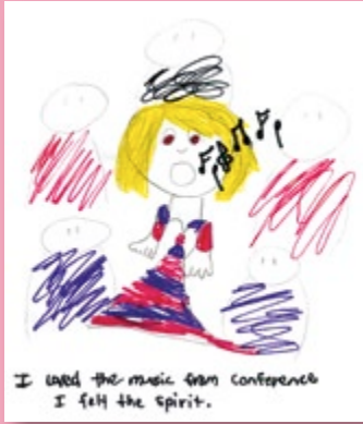
I loved the music from conference I felt the spirit.