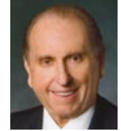
President Thomas S. Monson Go right