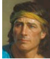
Mormon Go left