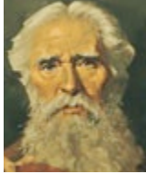
Moses Go down