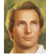
Joseph Smith Go up