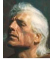
Moroni Go left