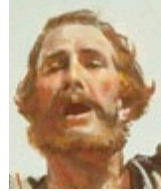
John the Baptist Go right