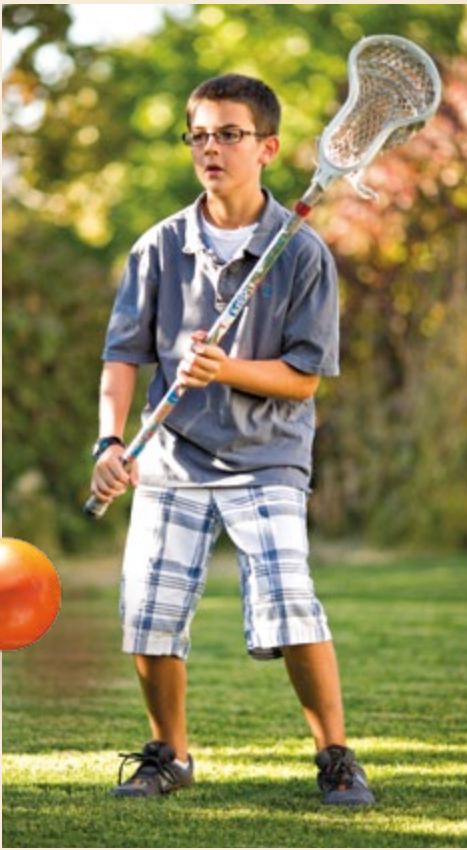
My favorite sport to play is lacrosse. I'm teaching my little brother to play too.