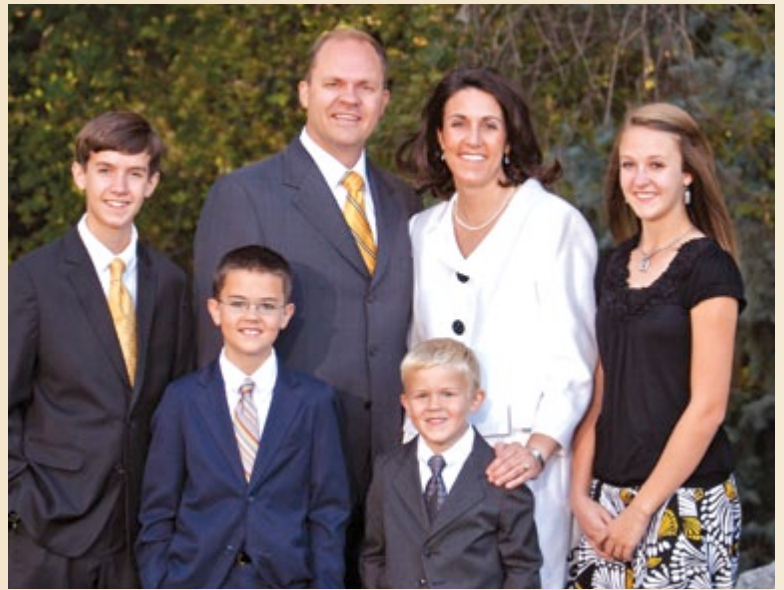
My mom and dad and older brother and sister have helped me by doing baptisms for the dead and other ordinances in the temple for the ancestors I find.