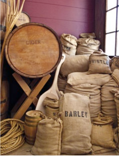
In this room of the store, people could trade fur pelts and other things for store goods such as ropes, nails, and seeds.