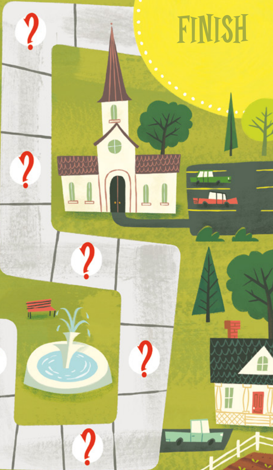
ILLUSTRATION BY KELLAN STOVER