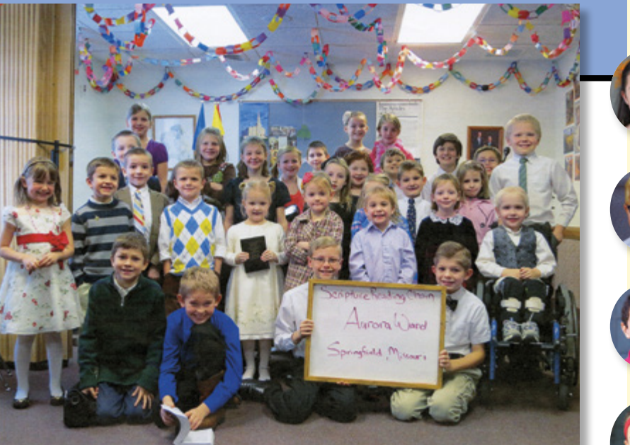
The Aurora Ward Primary participated in the Springfield Missouri Stake's challenge to read the Book of Mormon. The children kept track of their progress throughout the year by adding links to their "Scripture Reading Chain."