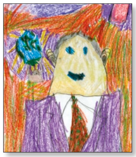
Lisa D., age 10, Utah, USA