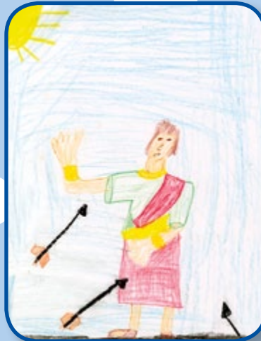
Bridger B., age 9, Colorado

Would you like to send us a poem or drawing? Turn to page 48 to find out how.