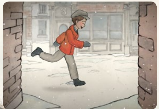
4. As Heber raced down the streets, something caught his eye as he ran past an alley.