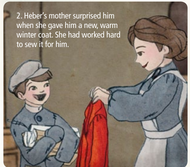
2. Heber's mother surprised him when she gave him a new, warm winter coat. She had worked hard to sew it for him.