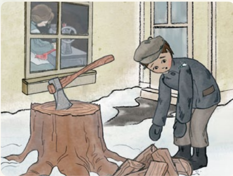
1. Young Heber J. Grant worked hard in his thin, worn jacket. His family was poor and didn't have money to buy a new coat.