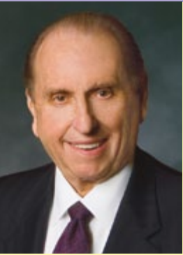
By President Thomas S. Monson